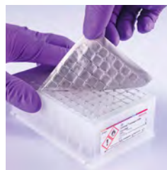
Shake, spin & peel off the foil seal