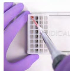
Add sample and lysis buffer