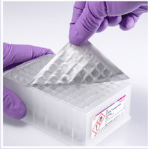
Shake, spin, and peel off the foil